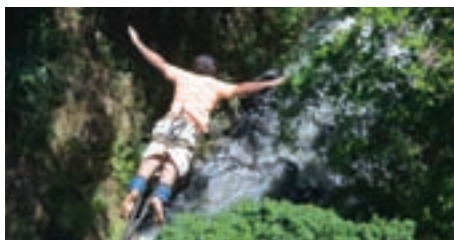
Sharesave for... ...the thrill of it