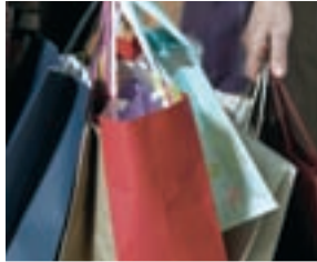
Sharesave for... ...a shopping treat