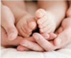
Sharesave for... ...a new mouth to feed