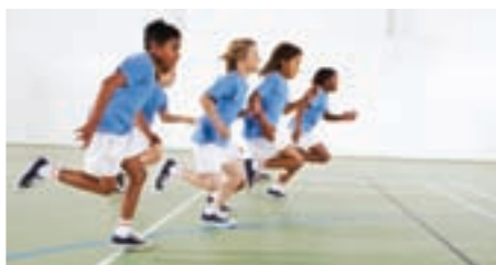
Sharesave for... ...their future