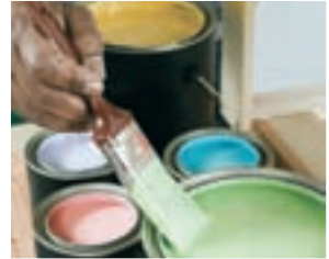
Sharesave for... ...home improvements