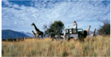
Sharesave for... ...the trip of a lifetime